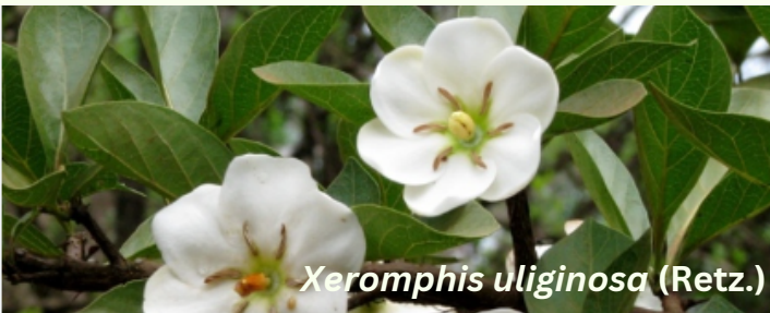
Xeromphis uliginosa (Retz.)